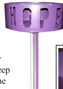
The Big Kahuna's "Spirit Stick" (example)

Team Captains – if you don't have your "official issue" Spirit Stick yet, you can pick one up at the American Cancer Society office. Remember, you can add to it, on it, or in it, but you can't take away from it! Random showcasing of Spirit Sticks will be done during prime time on stage Friday night. Judging will take place on stage Saturday morning, so be sure to keep your team's Spirit Stick on the track at all times. You never know when the judges will be checking your "spirit" and awarding Spirit Chips!